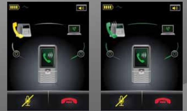
MERGING A CALL

It's easy to get started, too. A SmartSetup wizard on the touch screen guides you through the simple process of connecting phones and choosing preferences to get you started in minutes. Once you're up and running, the screen's colorful icons and intuitive menu system make call-handling a breeze.