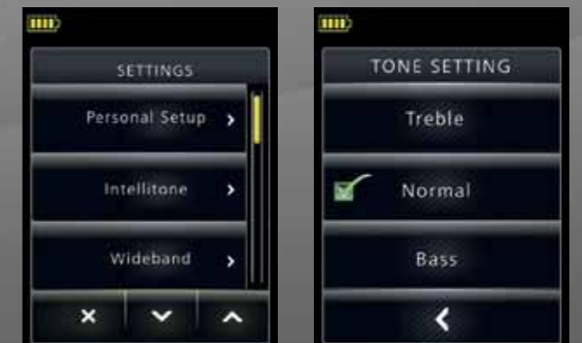
PERSONALIZING THE HEADSET